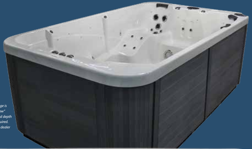
Our Wellness II Lounge is available in a "shallow" model if the standard depth of 4 1/2 feet is not required. Ask your authorized dealer for details.

The Wellness II Lounge has the same positive health benefits as the Wellness II (non-lounge), except it comes standard with a non-float lounge and powerful deep-tissue massage jets. You can swim indefinitely against a resistant current produced by powerful River Jets then connect exercise bands and row bars to make an intense workout. Lay back and relax in the integrated lounge seat to begin resting your muscles after a complete workout. The Wellness II Lounge has a full-sized swim area and has been engineered to take up as little room as possible in your backyard or fitness room. Begin your future of healthy living and exercise that you'll actually look forward to completing everyday in your Wellness Swim Spa.